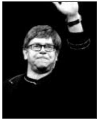
"Broadway Cares"