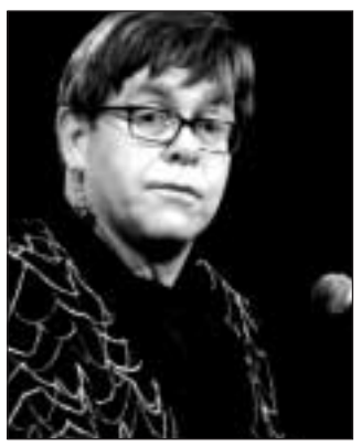
Hershey, PA