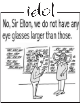
by Reggie Zippo