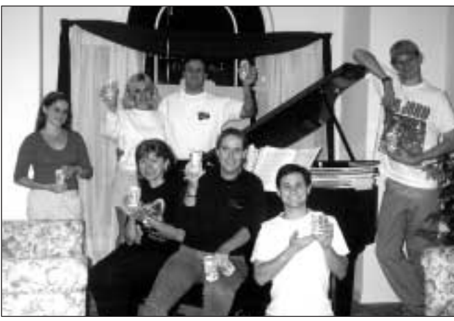
All smiles at the USA Convention