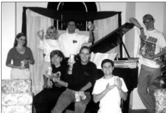
All smiles at the USA Convention