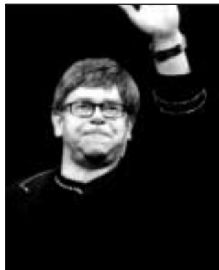
"Broadway Cares"