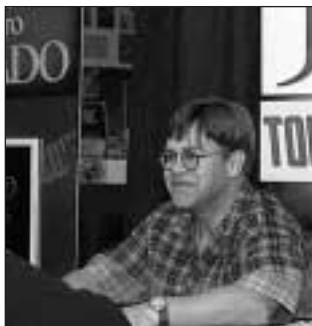
Elton at Tower Records