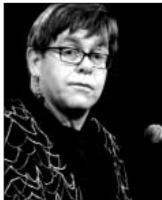
Hershey, PA